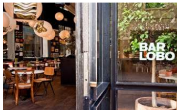
My Top 10 restaurants in the centre...