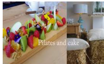
Pilates & Cake

Labels: Barcelona, best restaurants barcelona, disfrutar, eat, el bulli, foodies, special occasion, tasting menu