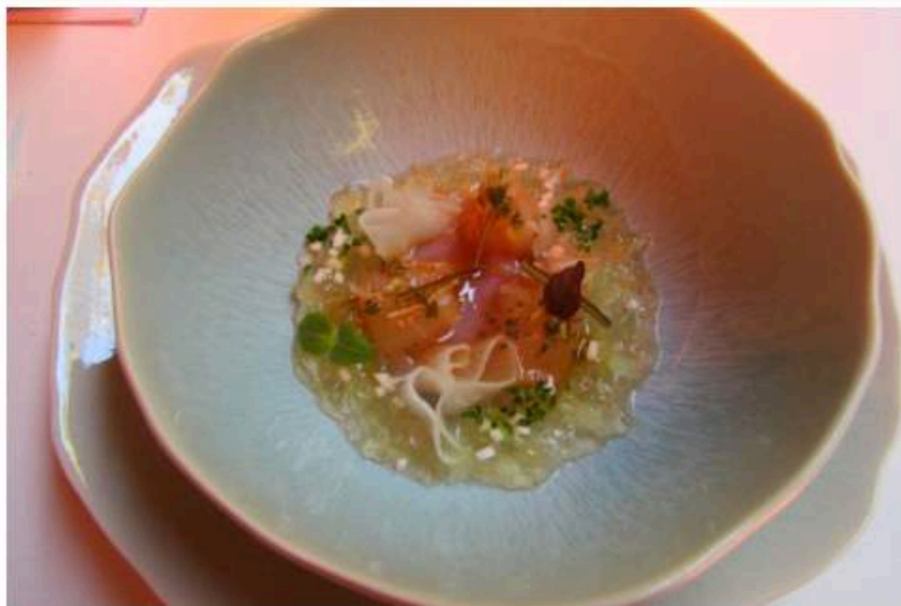
Art in a bowl at Moments restaurant, Barcelona.

But I'm not going to just list them all and leave you to it. Instead, I'd like to talk a little bit about the city's haute cuisine and highlight some of the restaurants and chefs that I believe best represent the Catalan capital's cultivated dining options. Shall we?