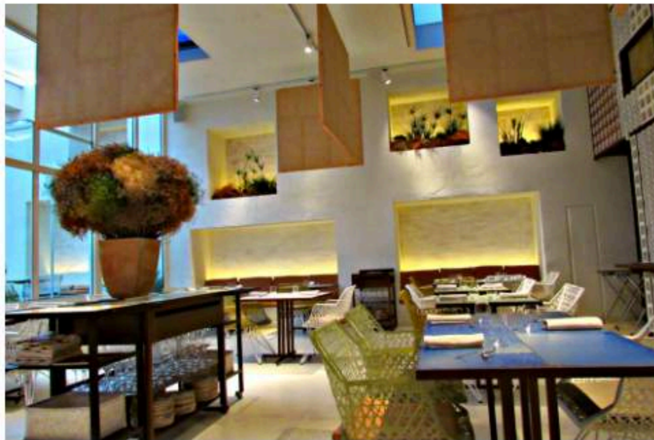
Disfrutar's bright and crisp interior.

But Ferran and Albert weren't the only chefs to enjoy fame and fortune after the closure of El Bulli. Barcelona is now awash with world-class restaurants run by the alumni who earned their stripes under Ferran Adrià's command. In fact, many have gone on to earn their very own Michelin stars.