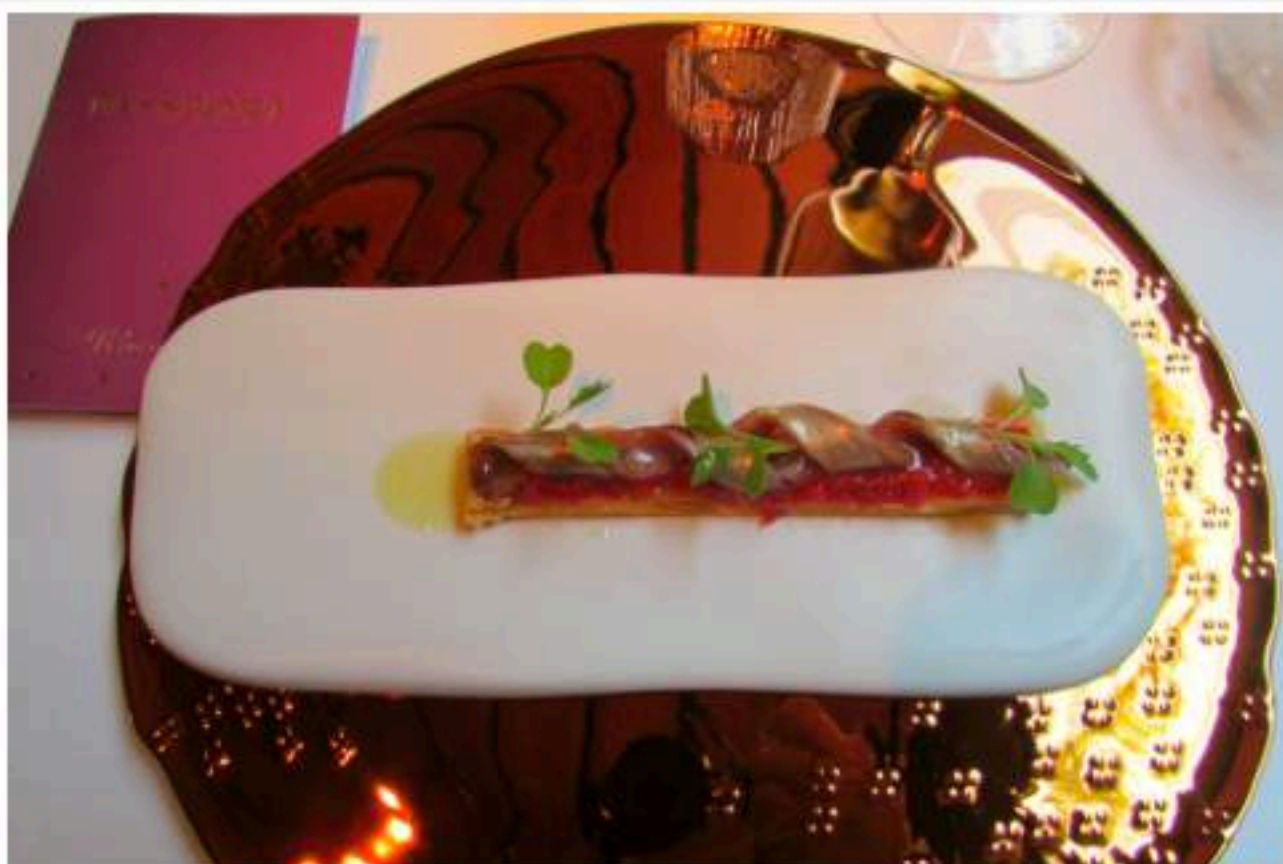
The starter and passport at Moments restaurant.

The New York mini burger and french fry added an extra dimension to the adventurous spirit of 'The Trip', but it was the fresh and zesty Bangkok monkfish with coconut that captured my imagination, presented like an abstract Joan Miró painting on the plate.