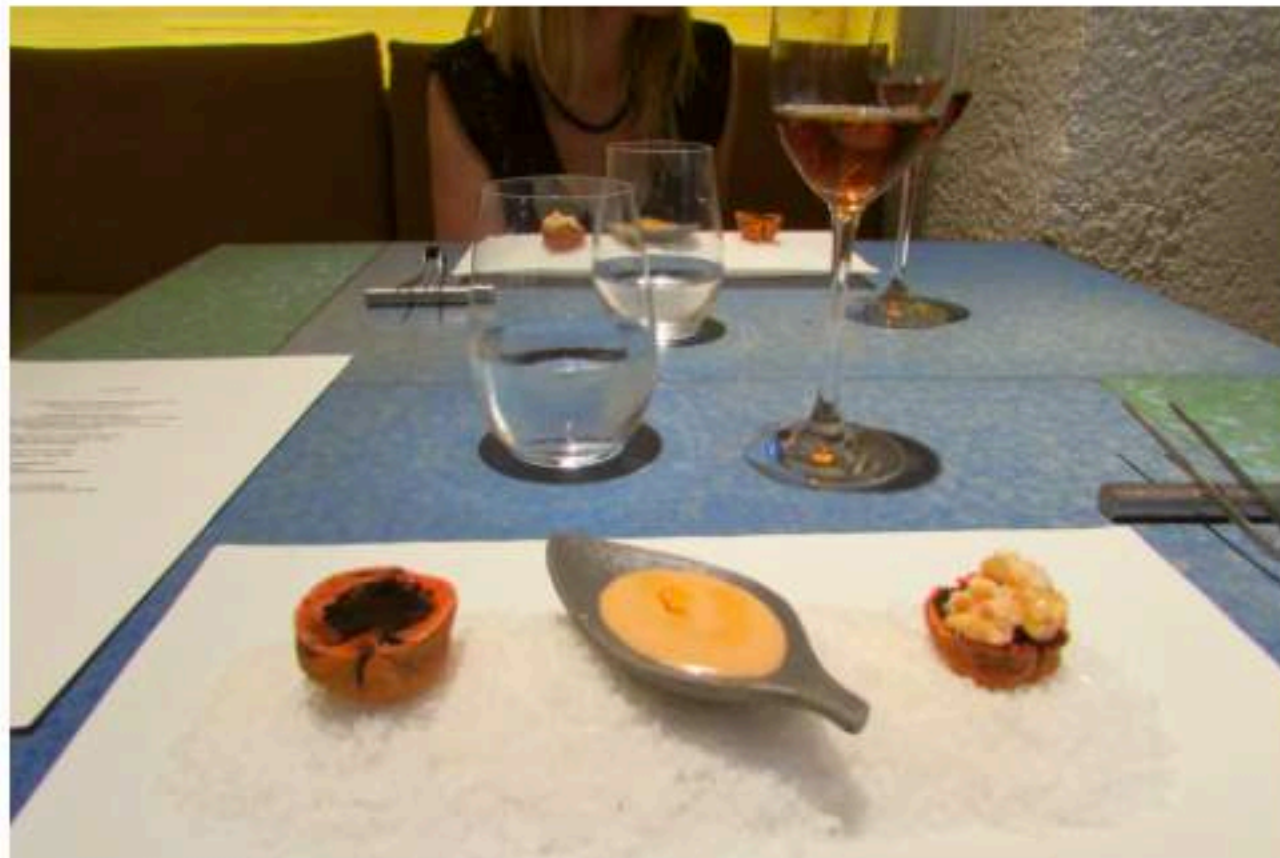
Walnuts and ratafia liquor at Disfrutar.

It's a wonderful thing, this openness, and you can't help but feel part of the process, the process of creating mind-bogglingly inventive dishes that surprise and delight with every bite. We enjoyed the 31-dish tasting menu (that's not a typo!). I'm not going to list each dish, but let me paint a picture by talking of masterpieces such as rose petals with lychee and gin – you eat the lychee and gently suck the beads of gin from the delicate and fleshy rose petals – followed by tender walnuts and ratafia, a bold and herbaceous Catalan liquor.